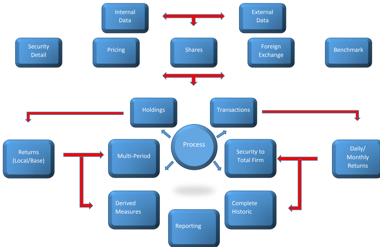
Figure 2: Alignment of Performance at All Levels

Phocion differentiates itself because it is a firm founded on performance and has the unique expertise in this area to be able to sift through the minutia to identify issues and potential issues in performance measurement. The most common approach to performance reviews is to take at face value many of the processes involved in the performance calculation and focus on the end result. This is also the worst approach to take and Phocion's success has been due to NOT taking anything at face value. Every aspect is verified to ensure that all factors align to the final results.